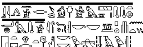
Papyrus of Ani plate VI:6-7

It is proposed that BEGIN RUBRIC SIGN and END RUBRIC SIGN be encoded and that rendering as red or as a black line above be left to implementation. The RUBRIC SIGNs function just as the CARTOUCHE SIGNs do.