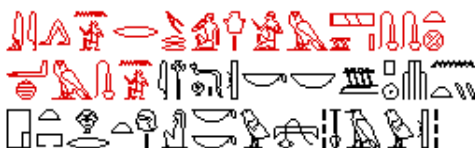
Papyrus of Ani plate VI:6-7

Red colour and black colour are encoded with special locking-shift sequences in the Manuel de codage . It should be noted that the Naxi or Tompa script (in China) also uses colour to achieve semantic distinctions, and it may not be practical to proscribe colour as a quality of plain text. In the present proposal, an encoding is given for red hieroglyphs, because the following editorial practice supports it: I give below examples from Budge 1895 in which the rubric is represented not by colour but in another way: